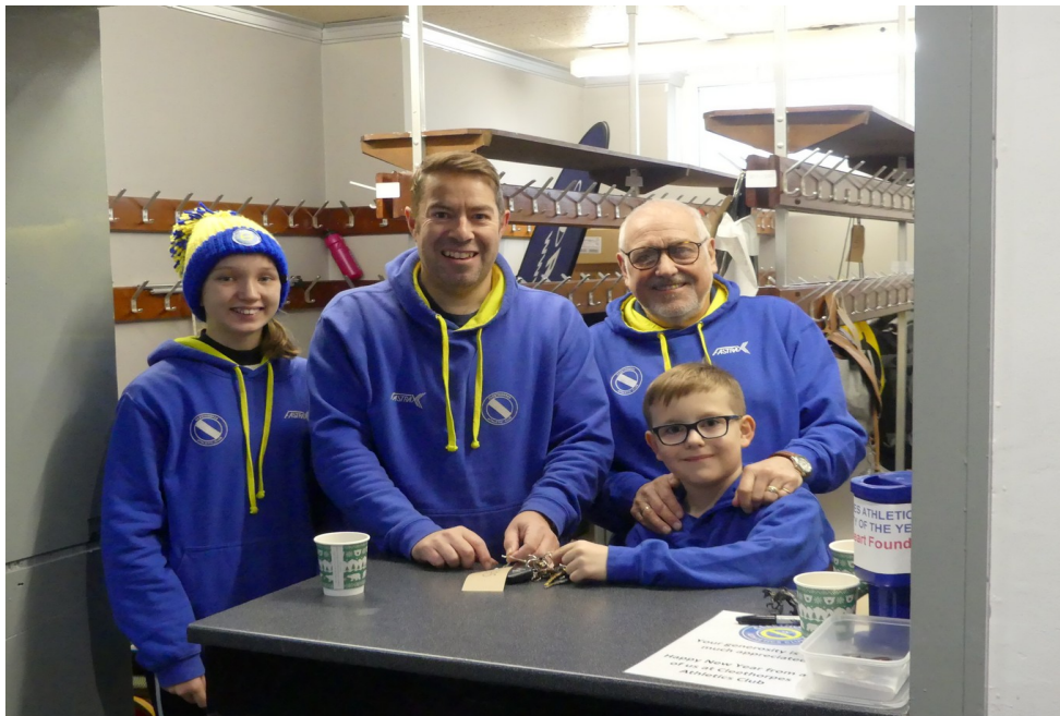
A warm welcome at the race venue.