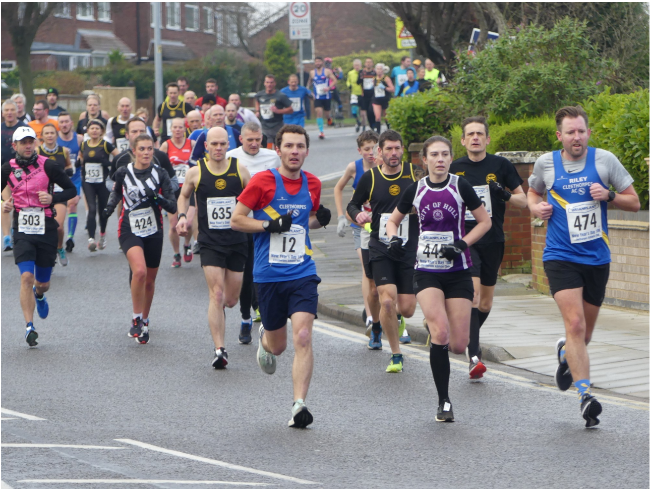
2020 Chichester Road, first time round.